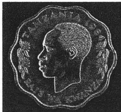
The first coinage portrait of Nyerere as seen on the obverse of a 1984 5 Senti.

Julius Kambarage Nyerere, was born in 1922. He became Prime Minister of Tanganyika in 1961 and President of Tanganyika in 1962. He played a major part in the negotiations, which in 1964 led to the union of the independent states of Tanganyika and Zanzibar, a union which brought Tanzania into existence. Consequently Nyerere became the first President of Tanzania and held that position until his retirement in 1985. Nyerere died in London on October 14th 1999.