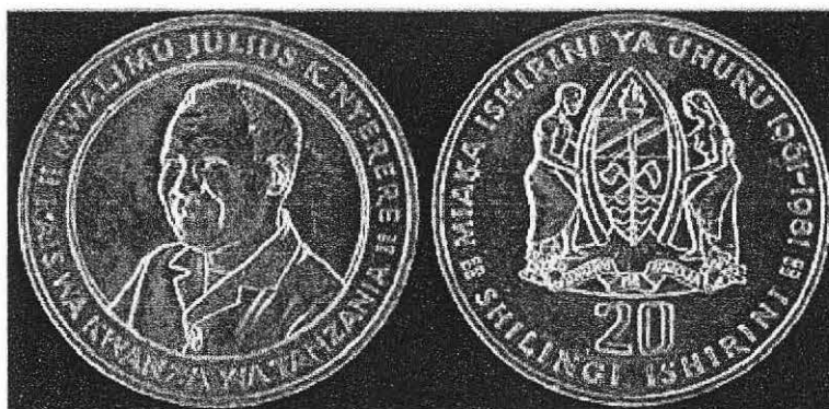
The third coinage portrait of Nyerere as seen on the 20 Shilingi of 1981, one of the series three coins on which this portrait debuted.

The second Nyerere portrait must be the hardest Tanzanian portrait to get hold of, appearing on just one type and a scarcer one at that. The type with this portrait is the 5 Shilingi of 1978, a Food and Agricultural Organisation coin marking the occasion of the "F.A.O. Tenth Regional Conference for Africa". Why this different portrait was used for this type, who designed it and whether it had only ever been intended for use on this one type I might never know. The legends around the portrait are as per the standard types made with the first Nyerere portrait.