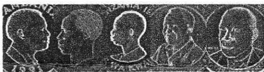
All five portraits.

...meaning "Sheikh Abeid Amani Karume - First President of Zanzibar" AND the date and ADDITIONALLY with "1964-1972" near to portrait these are the years during which Sheikh Karume was President of Zanzibar.