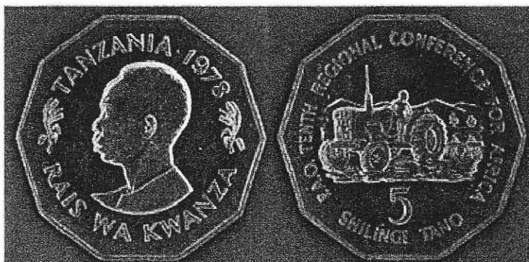
The second coinage portrait of Nyerere, its only appearance was on this coin, the 5 Shilingi of 1978.

The second Nyerere portrait must be the hardest Tanzanian portrait to get hold of, appearing on just one type and a scarcer one at that. The type with this portrait is the 5 Shilingi of 1978, a Food and Agricultural Organisation coin marking the occasion of the "F.A.O. Tenth Regional Conference for Africa". Why this different portrait was used for this type, who designed it and whether it had only ever been intended for use on this one type I might never know. The legends around the portrait are as per the standard types made with the first Nyerere portrait.