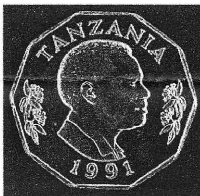
The coinage portrait of Mwinyi as seen on the obverse of a 1991 5 Shilingi.

Ali Hassan Mwinyi was born in 1925. Mwinyi was appointed acting President of Zanzibar in 1984 following the resignation of Sheikh Mwinyi Aboud Jumbe. (That resignation made during a period when the Tanzanian government seemed to be trying to take greater control over Zanzibar.) After a few months as acting President of Zanzibar, Mwinyi became President of Zanzibar proper and held that position until 1985 when elections were held throughout the whole of Tanzania. These elections saw Mwinyi move up to the position of President of the United Republic and he held this position for ten years (two full 5 year terms) i.e. upto the time of the 1995 elections. Those elections saw the nation's current President take office, he is Benjamin William Mkapa.